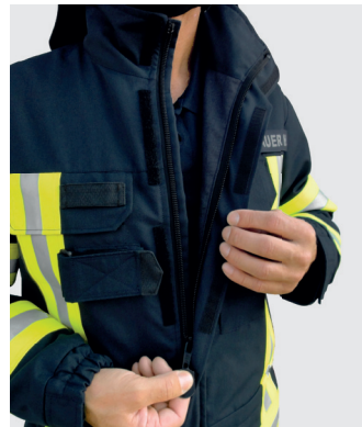
Zip with cover flap