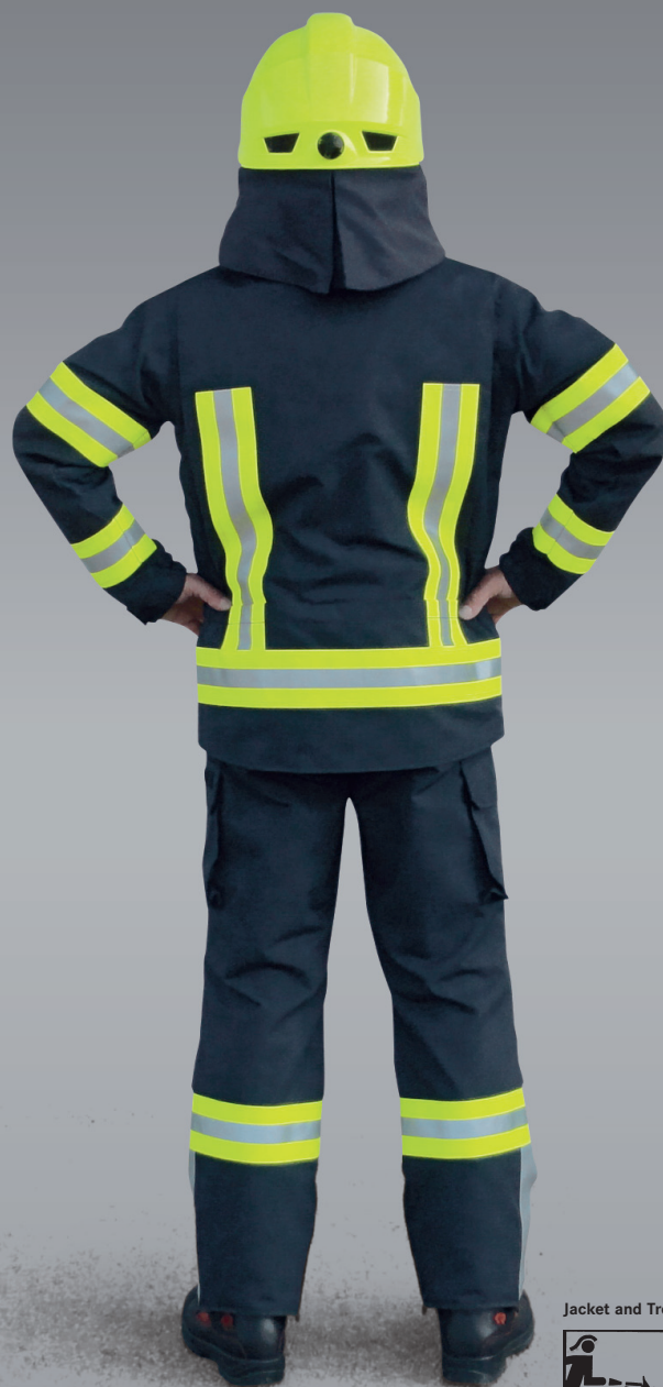
Jacket and Trouser