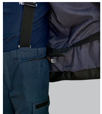
Attachment trousers and jacket