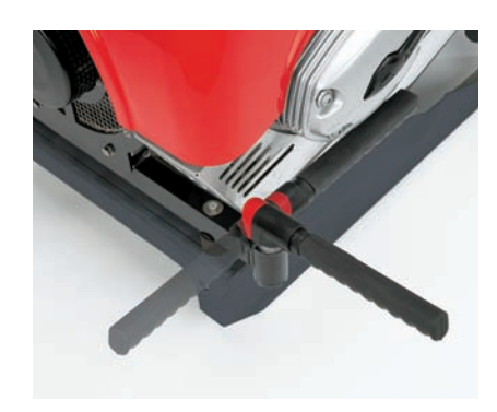
FOX portable pump with swinging out carrying handles

A portable pump has to be carried the last few meters to the water source. The amazingly light weight of only 167 kg (tanks full) for a pump with this power really helps facilitate fire fighting operations. Additionally, the four fold-out handles, and the low point of gravity, make for unrivalled handling even on the most difficult terrain.