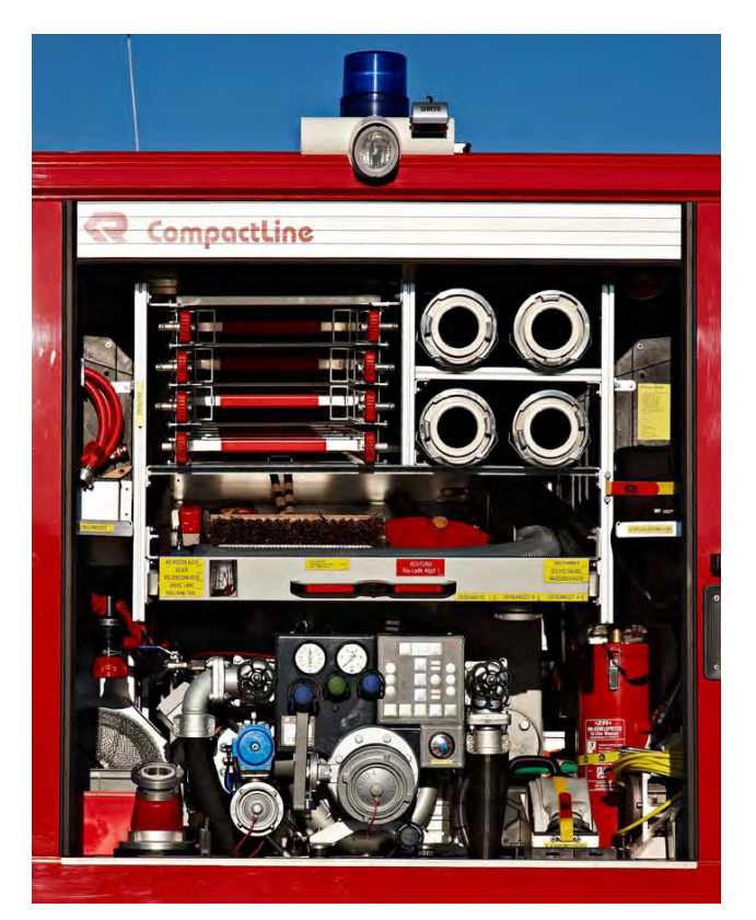
Space-saving installation also in rear mount version Operation via LCS (Logic Control System)