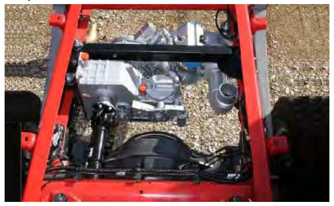
Underfloor mounting - saves space for more compartment space