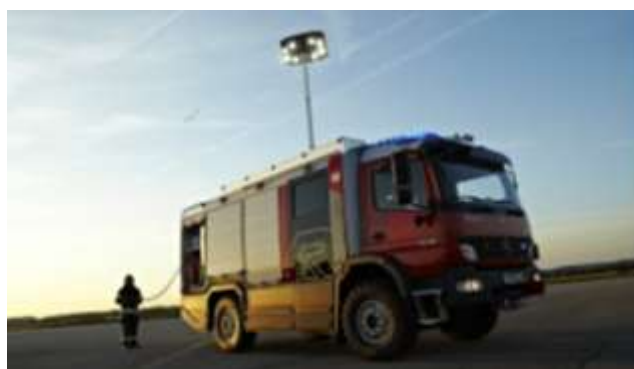
FLEXILIGHT LED in municipal vehicle AT