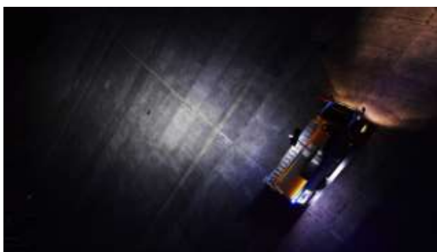
FLEXILIGHT LED in action