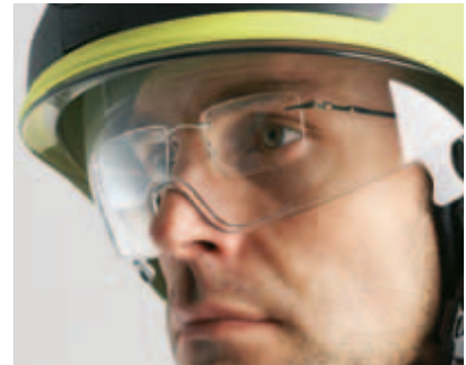
Separate, swivel eye protection visor**