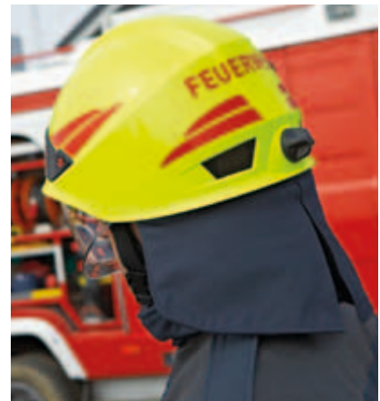
157002 / 157064 / 1568906 / 1570917