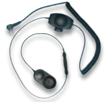
15665612 / 15665405