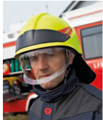
157002 / 15685001