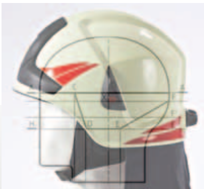
HEROS-xtreme: Full shell