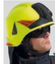
15685401 / 156849 / 156864