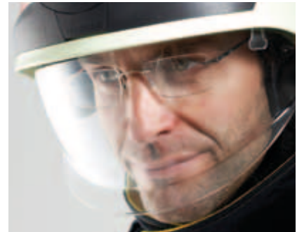
Extensive facial protection

Both visors are also suitable for wearers of spectacles