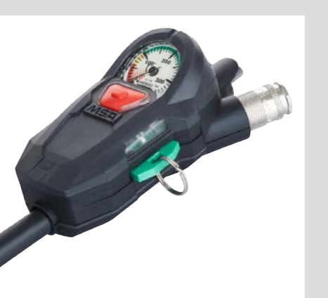
SLS with Safety Key