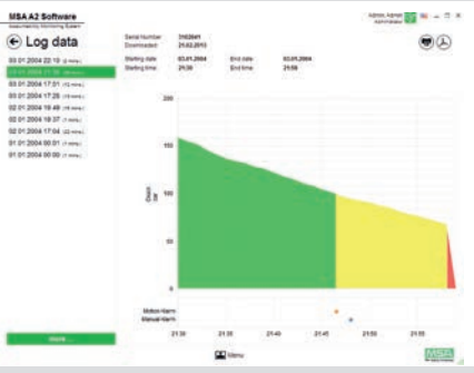
A2 Software Incident Log