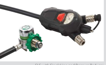
SLS with SingleLine and Pressure Reducer